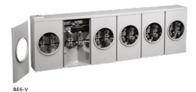
NOTE: Supply from an underground network often requires use of stud type connector. Consult your local utility.

200 A (main lugs) 600 V; multiple position – horizontal 100 A per position