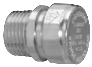
CICG50A250 / CICG150D1375