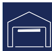
General Area Lighting