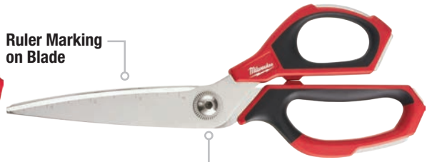
Bolt Lock – Blades will not loosen