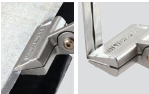
3/8" & 1" Markings for More Accurate Folds