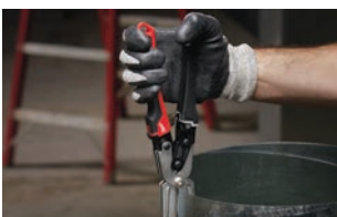
Symmetrical Handles for Over-Hand Grip