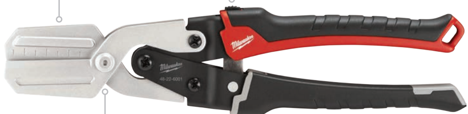
Bolt Lock – Blades will not loosen