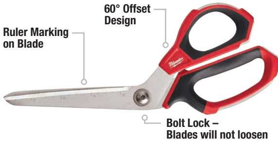
Bolt Lock – Blades will not loosen