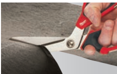
Index Finger Groove