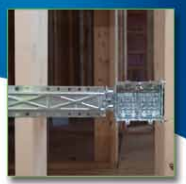
Code compliant installation.