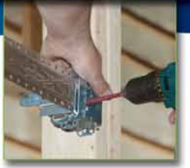
Screw bracket on box.