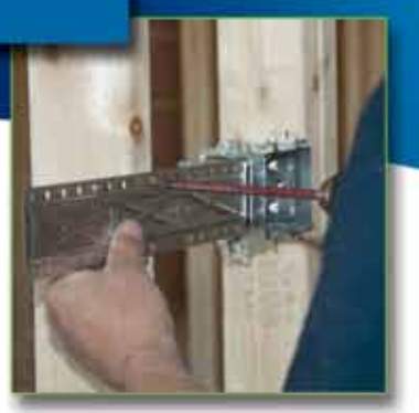
Screw bracket to opposite wood stud.