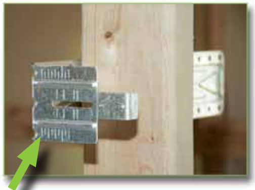
Using the guides built into the bracket, box depth can be adjusted to fit the application.