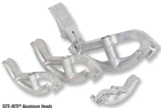
SITE-RITE® Aluminum Heads 840A, 841A, 842A, 843A