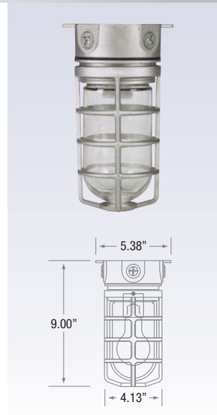
DVCS100CG Pendant Mount