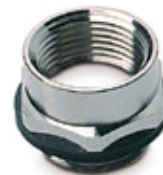
Supplied standard with all hoods and bases. Special sizes/hood combinations available.