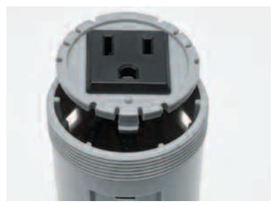
8. Remove receptacle by pressing three tabs located on side of tube.