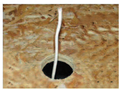
3. Pull cable through floor.