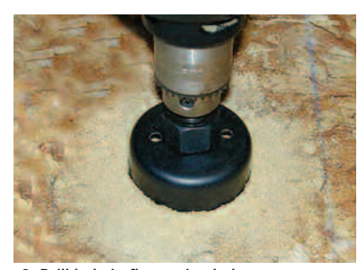
2. Drill hole in floor using hole saw.