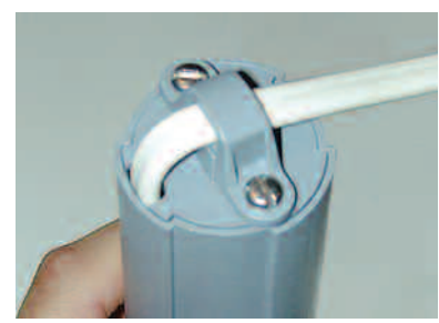
5. Secure wire clamp on bottom of tube.