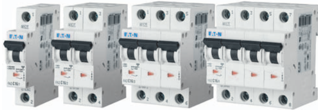
Optimum and Efficient Protection for Every Application