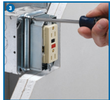
3 Re-tighten... Adjustment screws.