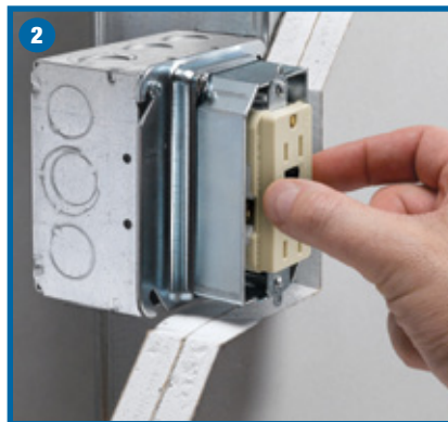
2 Adjust... Inner ring to be flush with wall surface.