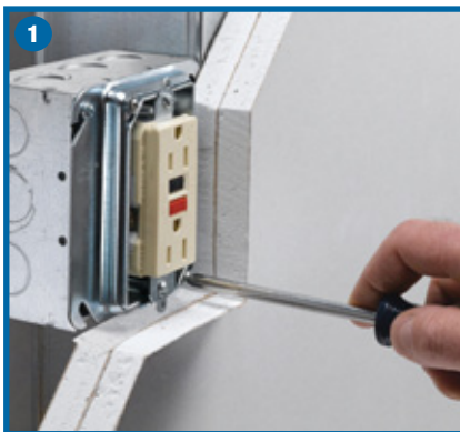
1 Loosen... The two adjustment screws located on opposing corners of the mud ring.