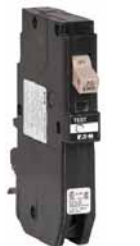
Type CH AFCI Single-Pole PON Combo Circuit Breaker