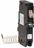
Type CH AFCI Single-Pole Circuit Breaker