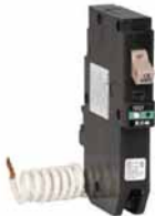
Type CH AFCI Single-Pole Circuit Breaker