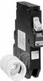
Type CH AFCI Single-Pole Circuit Breaker