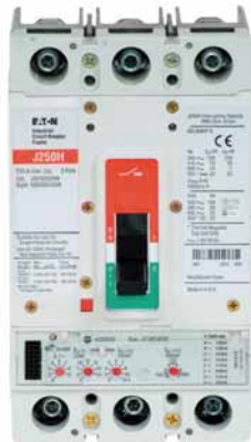
JG-Frame (63–250 Amperes)