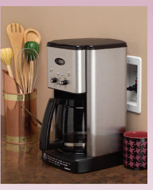
Attractive! DVFR1W shown.

Box positioning tabs are set for 1/2" or 5/8" drywall.