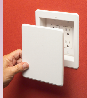
Optional box cover. DVFRC shown.