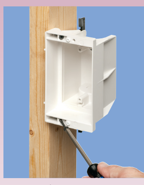
New Work... Screws provided for fast and easy mounting to stud