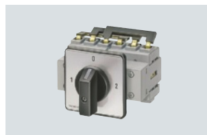
3LD2 122-7UK01 3-pole changeover switch for front mounting with knob