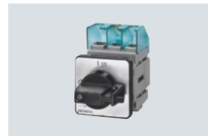
3LD2 222-0TK1 switch for front mounting with knob