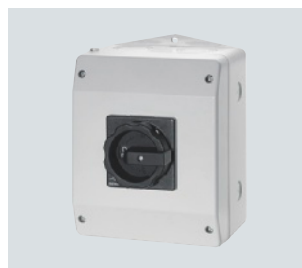
3LD2 265-8VQ51-0AF6 solar plant isolator