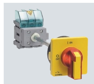
3LD2 217-1TL13 switch for floor mounting with rotary operating mechanism and defeatable door coupling