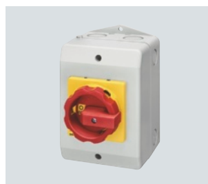
3LD2 264-0TB5 switch in molded-plastic enclosure