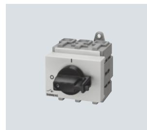
3LD2 530-0TK11 switch for distribution board mounting with knob