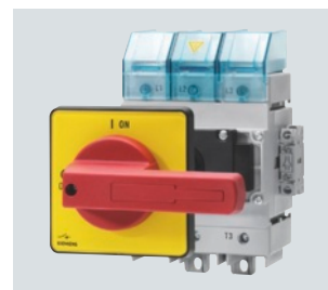
3LD2 418-0TK13 switch for floor mounting, 250 A, with rotary operating mechanism and door coupling