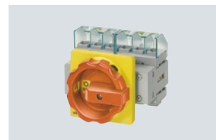
3LD2 103-3VK53 6-pole switch for front mounting with rotary operating mechanism