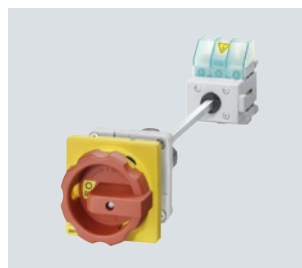
3LD2 144-0TK53 switch for floor mounting with rotary operating mechanism and door coupling