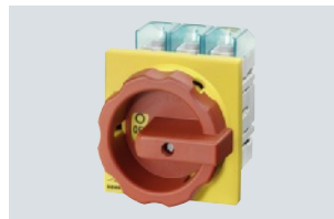
3LD2 704-0TK53 switch for front mounting with rotary operating mechanism