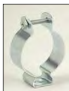
With Bolt and Nut