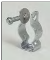
With Retained Bolt and Thread Impression