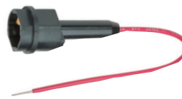
HLR fuse holder