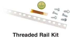
Threaded Rail Kit