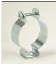
With Bolt And Nut