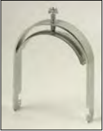
B1532S thru B1564S