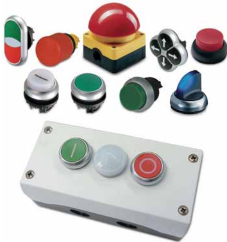
22.5 mm Modular Pushbuttons—M22