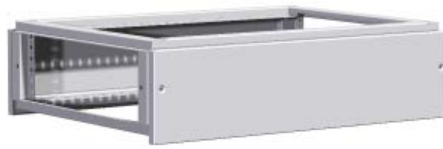
Top Cabling Module