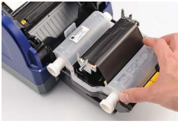
Installs in 5 seconds and the ink always faces the right direction!