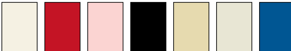
Primer Red Pink Flat Black Ivory Light Almond Blue

To order custom metal wall plates, see Pages P-40 – P-42. For additional colors consult factory.