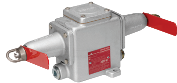
AFU0333-66 Double End