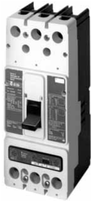
Typical J-Frame Breaker