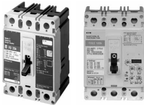
Typical F-Frame Breaker F-Frame Breaker with Electronic Trip Unit