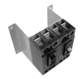
QJ Mechanical Interlock MI5444