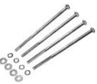
Mounting Screw Kit MSE6