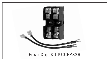
Fuse Clip Kit KCCFPX2R

Secondary Voltage is the voltage required for load operation which is connected to the transformer load voltage terminals.