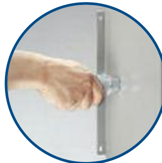
1. Install fitting on enclosure

When using a single conductor cable, an aluminum fitting must be used. TEK™ Teck Cable Fittings are easily installed, as no disassembly is required and there are no loose parts