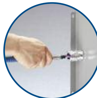
3. Slacken gland nut and insert prepared cable