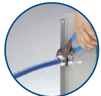
4. Hand tighten gland nut to hold cable, then wrench tighten