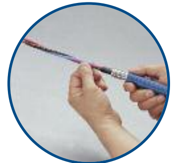
2. Prepare cable