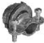
Zinc Die Cast Locknut