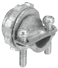
Zinc Die Cast Locknut