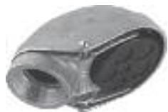
CIEFSA-1/2 / CIEFSA-4