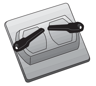
Locking Toggle Switch Sand-cast Aluminum FS-2-WSCA