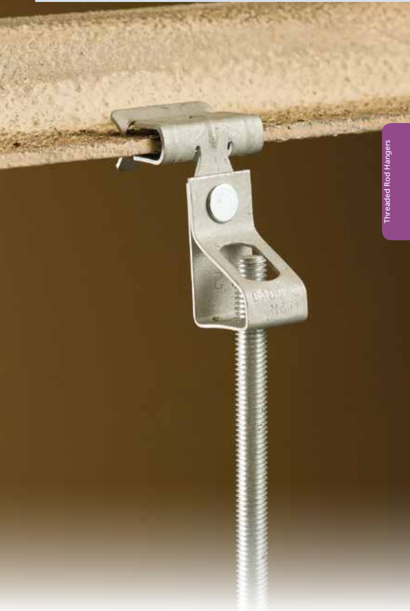
Threaded Rod Hangers