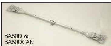
BA50D & BA50DCAN