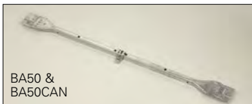
BA50 & BA50CAN