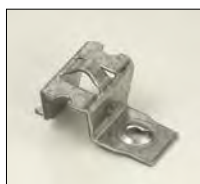
BA50C3T & BA50C4T