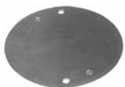
CIC-93 / S341E-R

Note: Covers are raintight when used with appropriate Red Dot boxes. All covers packed with gasket and screws.