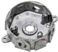
CIC-8444 / CIC-8448