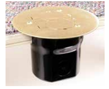
862C Residential Floor Box installed in a wood floor.