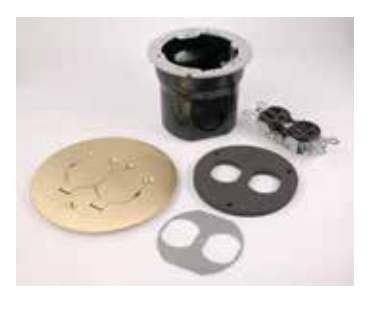
862 Series Floor Boxes can be ordered as kits that include floor box, receptacle, and cover assembly.