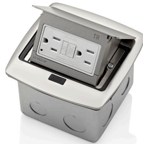
Self-Test GFCI Tamper-Resistant Receptacles