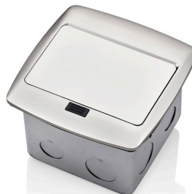
Brushed Nickel (-BN)