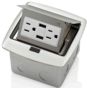
USB Charger Tamper-Resistant Receptacles