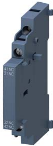
LATERAL AUXILIARY SWITCH 2NC, SCREW CONNECTION, FOR CIRCUIT-BREAKERS 3RV2