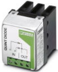
Redundancy module QUINT-DIODE/40

Please be informed that the data shown in this PDF Document is generated from our Online Catalog. Please find the complete data in the user's documentation. Our General Terms of Use for Downloads are valid ( http://phoenixcontact.com/download )