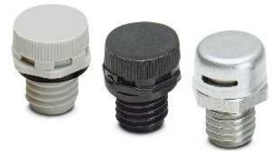
Pressure compensation elements