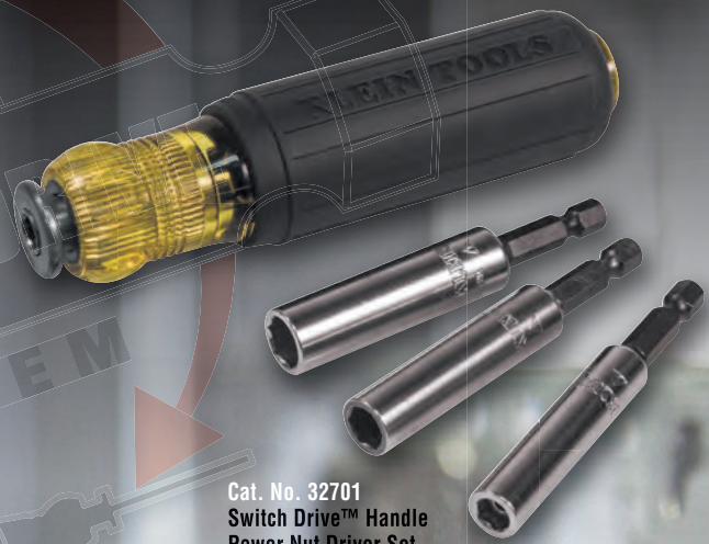
Cat. No. 32701 Switch Drive™ Handle Power Nut Driver Set