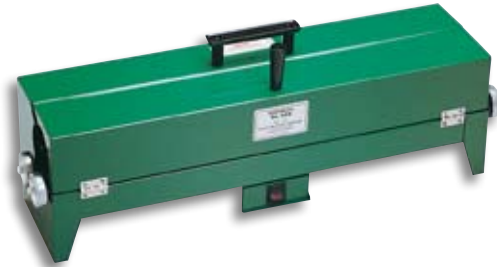
120 VAC 20 AMP