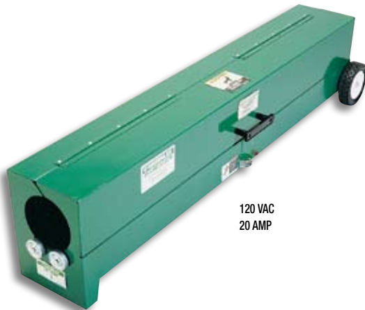
120 VAC 20 AMP