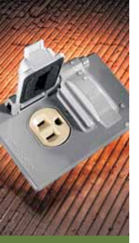
Weather Protective Devices