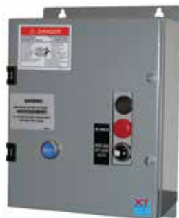
NEMA Type 12/3R