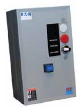
NEMA Type 1