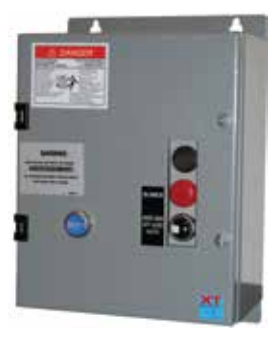
NEMA Type 12/3R