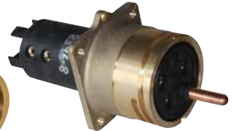
Female Panel Mount