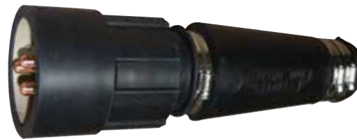
Male Cable Attachable