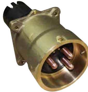
Male Panel Mount