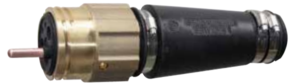
Female Cable Attachable