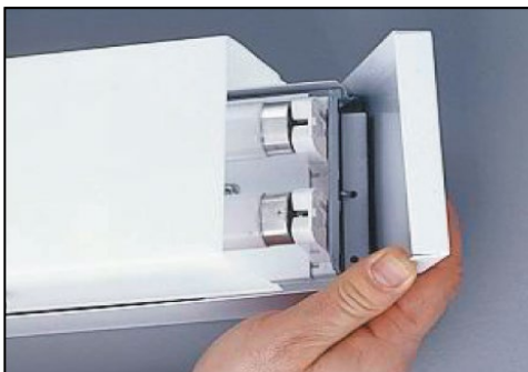
Spring-loaded end cap.