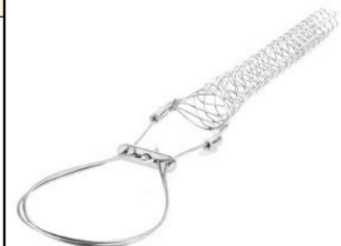
Locking Bale Grips (Universal Eye)