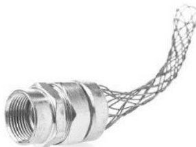
Straight Female Connector