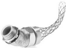
45° Male Connector