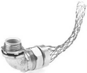
90° Male Connector