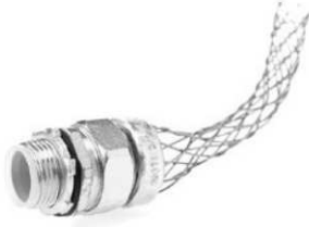
Straight Male Connector