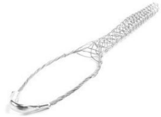
Single Eye Grips