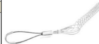
Offset Eye Grips