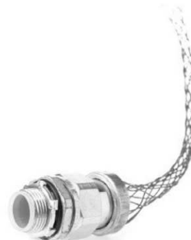
Non-Metallic Straight Male Connector