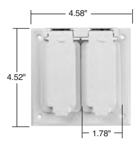
Dimensions for Two Gang Cover