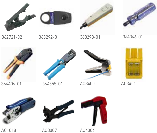
362721-02 363292-01 363293-01 364346-01 364406-01 364555-01 AC3400 AC3401 AC1018 AC3007 AC4006