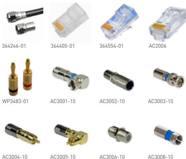
364246-01 364405-01 364554-01 AC2006 WP3483-01 AC3001-10 AC3002-10 AC3003-10 AC3004-10 AC3005-10 AC3006-10 AC3008-10